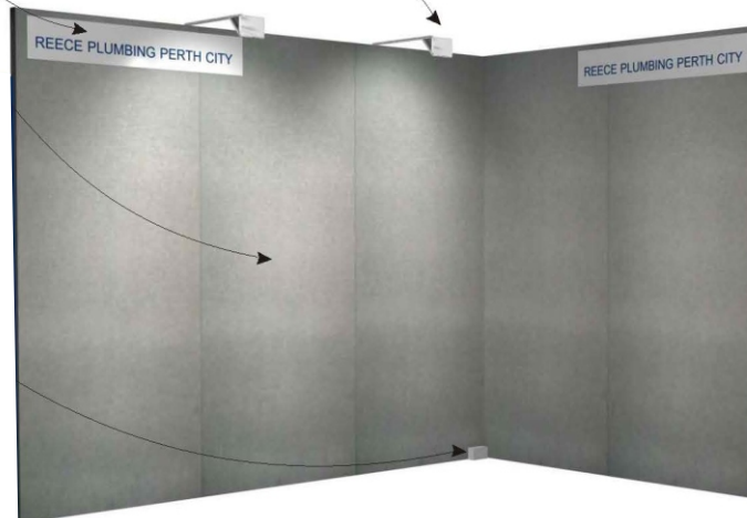
3m x 2m Display